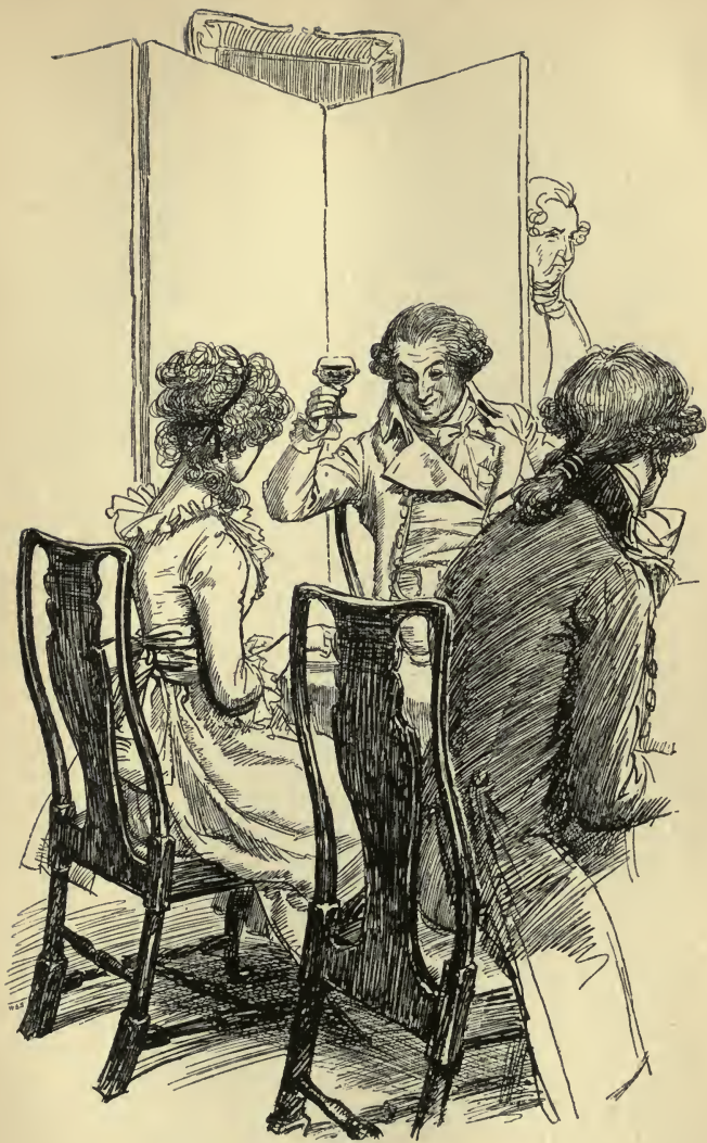
Drinking to her best affections.